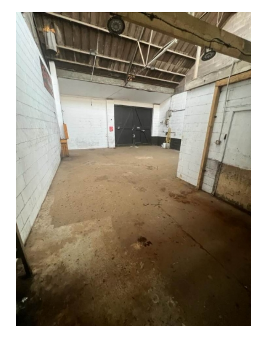
£900 PCM High street, Tunstall ST6 5ET Commercial Property